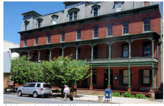
Existing Union Hotel building along Main Street

The Redevelopment area consists of 15 lots situated on Main Street, Chorister Place, Bloomfield Avenue and Spring Street in the Borough's DB Downtown Business zone district. The majority of lots in this area have frontage on Main Street and Spring Street with the exception of two lots on Bloomfield Avenue and two lots along Chorister Place, as set forth on the map on the following page. The entire study area is located in the Borough's Historic District.