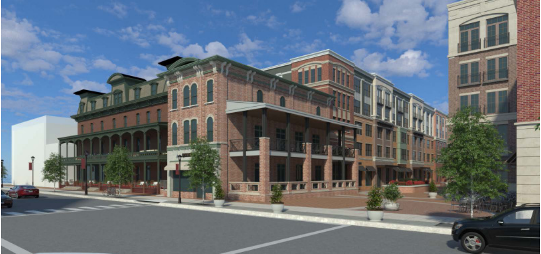
Main Street, looking east toward the plaza