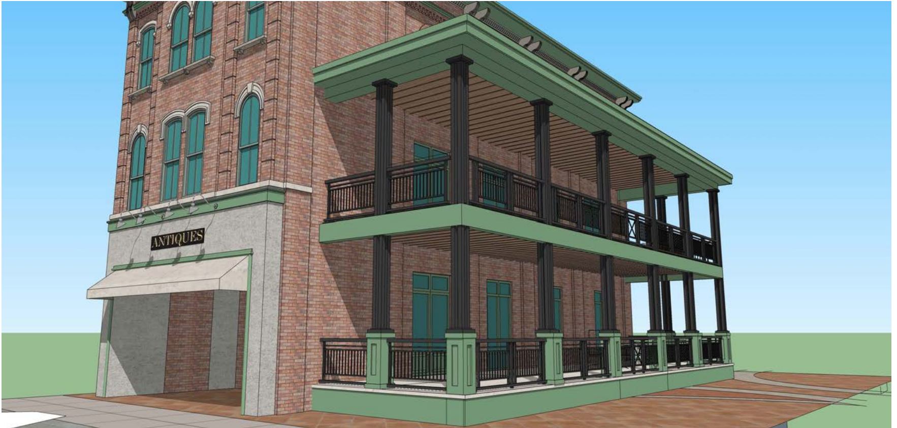
Porch for 78 Main Street Building