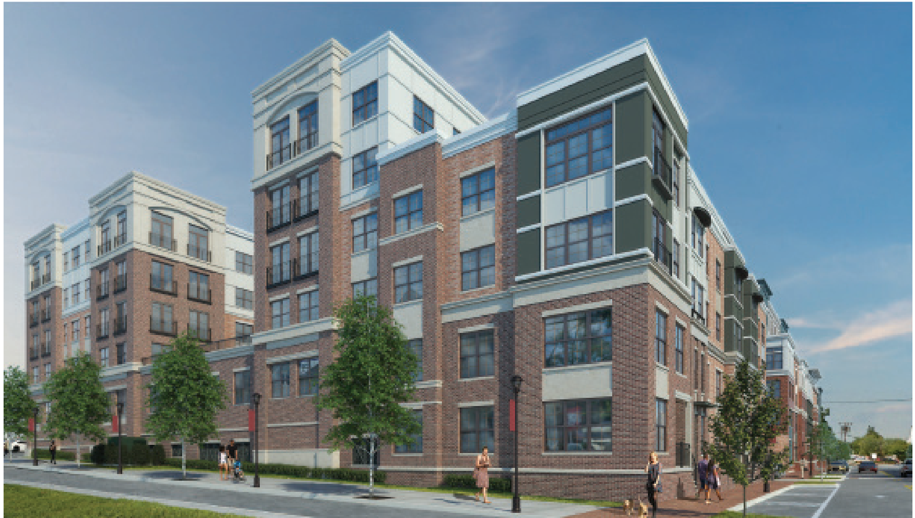
SPRING STREET & CHORISTER PLACE PERSPECTIVE © 2018 WASKO

MINNO WASKO ARCHITECTS AND PLANNERS 80 LAURELVALE DRIVE, FARMINGDALE, NY 11735-1800 WASKO@WASKO.COM