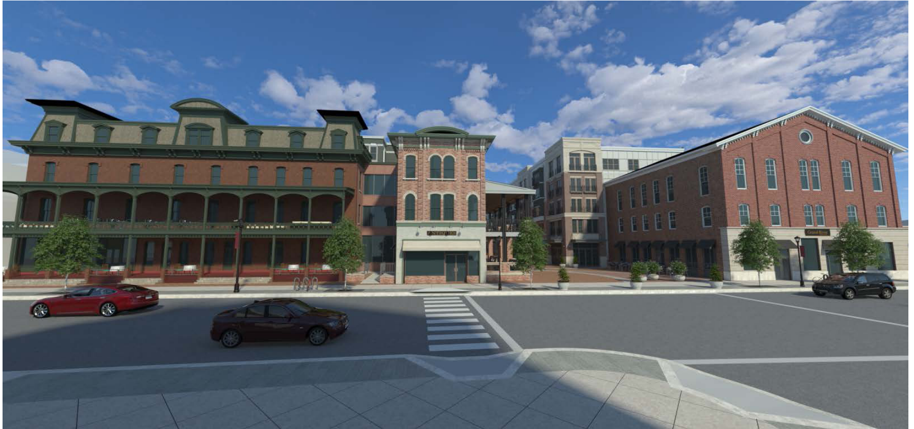
View from Courthouse steps