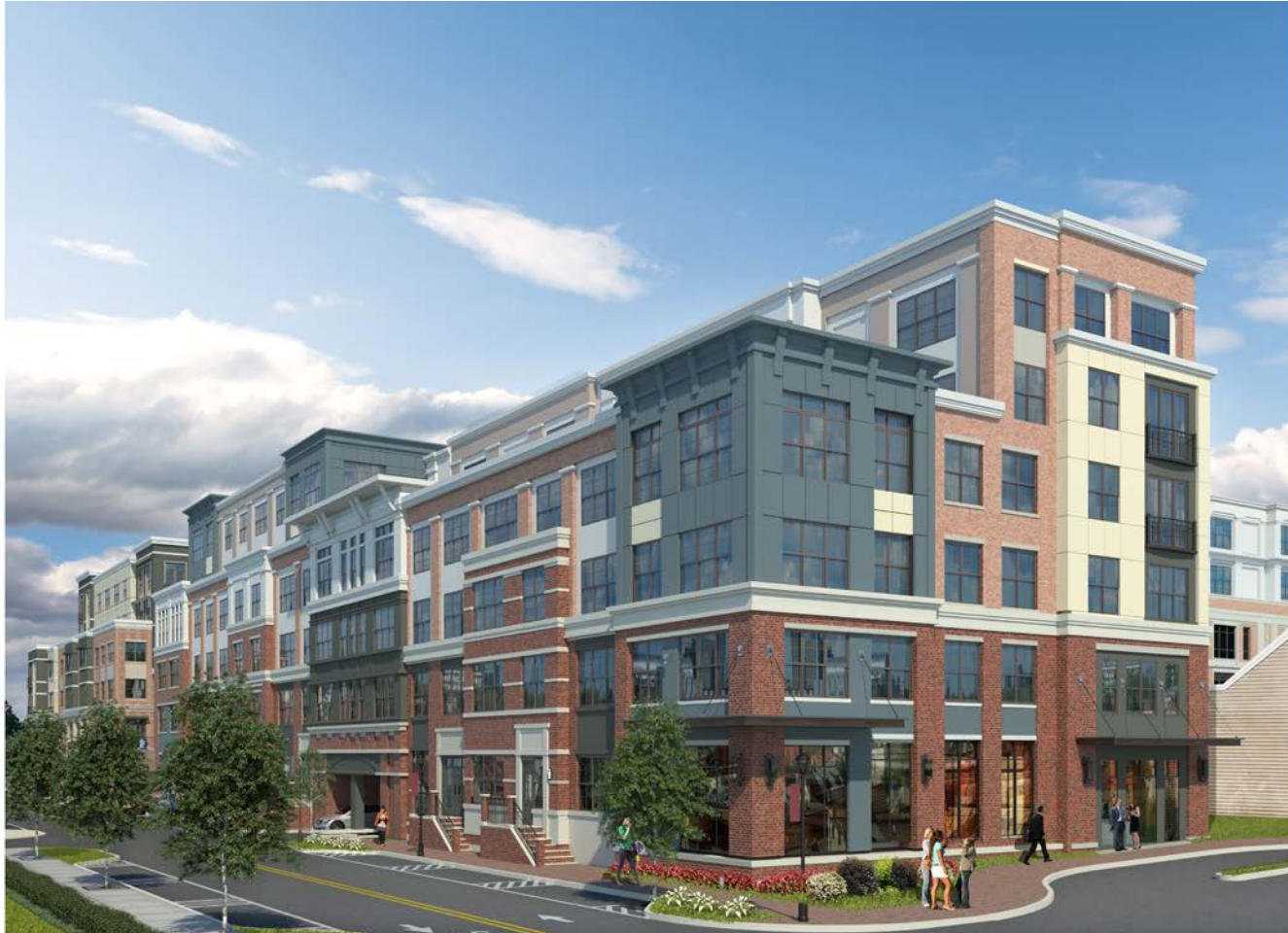
SPRING STREET & BLOOMFIELD AVE. PERSPECTIVE