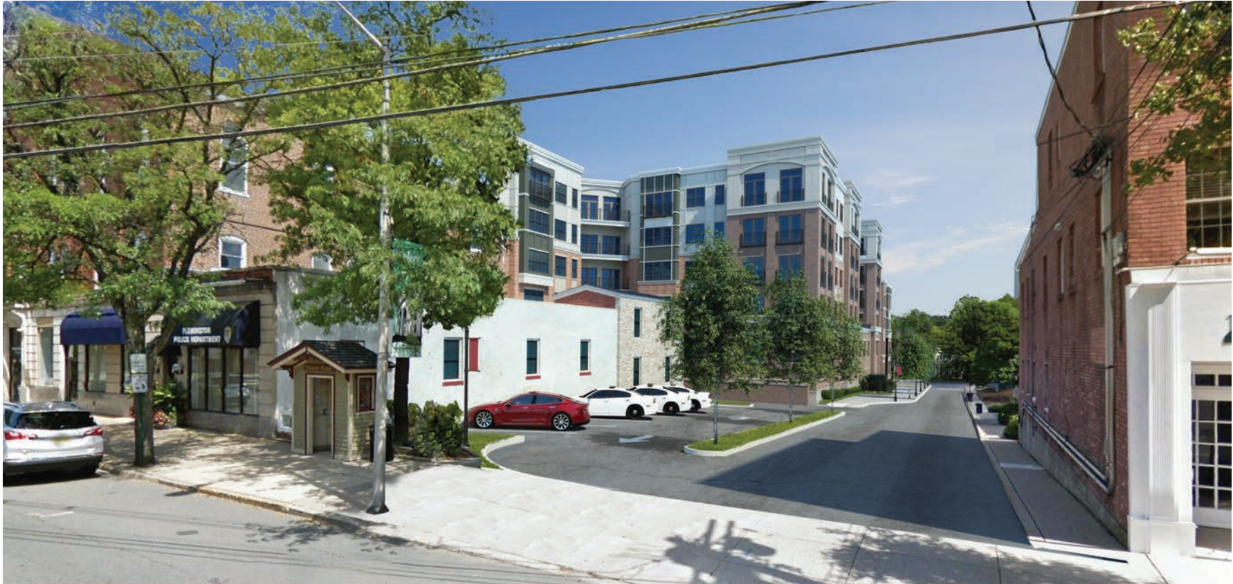
MAIN STREET & CHORISTER STREETVIEW