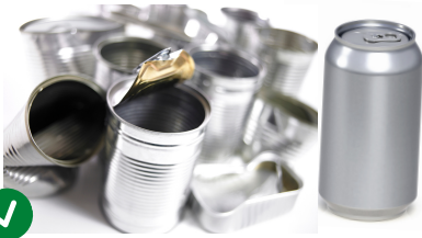
✓ Food & Beverage Cans steel, tin, and aluminum