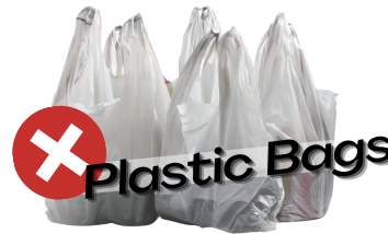
✗ Plastic Bags