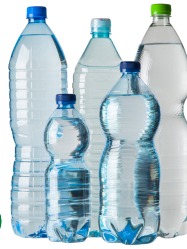
✓ Plastic Beverage Bottles & Cartons including milk jugs