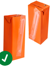
✓ Juice Boxes