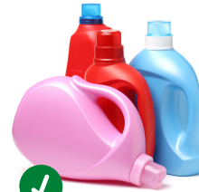
✓ Laundry & Shampoo Bottles