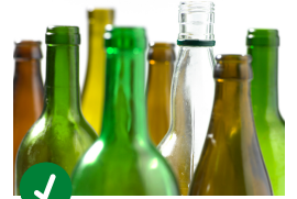
✓ Glass Bottles/Jars all colors