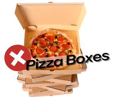
✗ Pizza Boxes